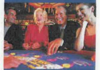
First Class Gaming