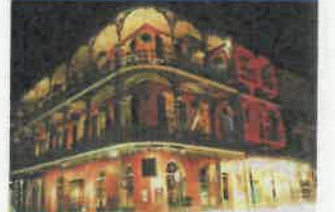
Free Time in French Quarter of New Orleans