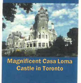
Magnificent Casa Loma Castle in Toronto