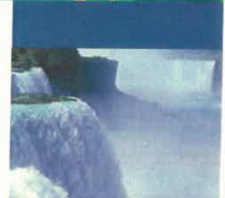
World's most famous Falls

Insurance payment enclosed: _____ (payable to Travel Insured International) See back side for insurance prices Insurance premium is based on trip cost. Please refer to insurance prices on the back of this flyer.