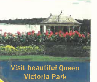
Visit beautiful Queen Victoria Park