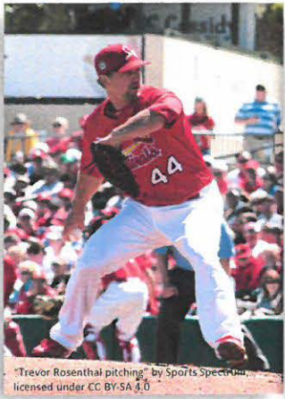
"Trevor Rosenthal pitching"