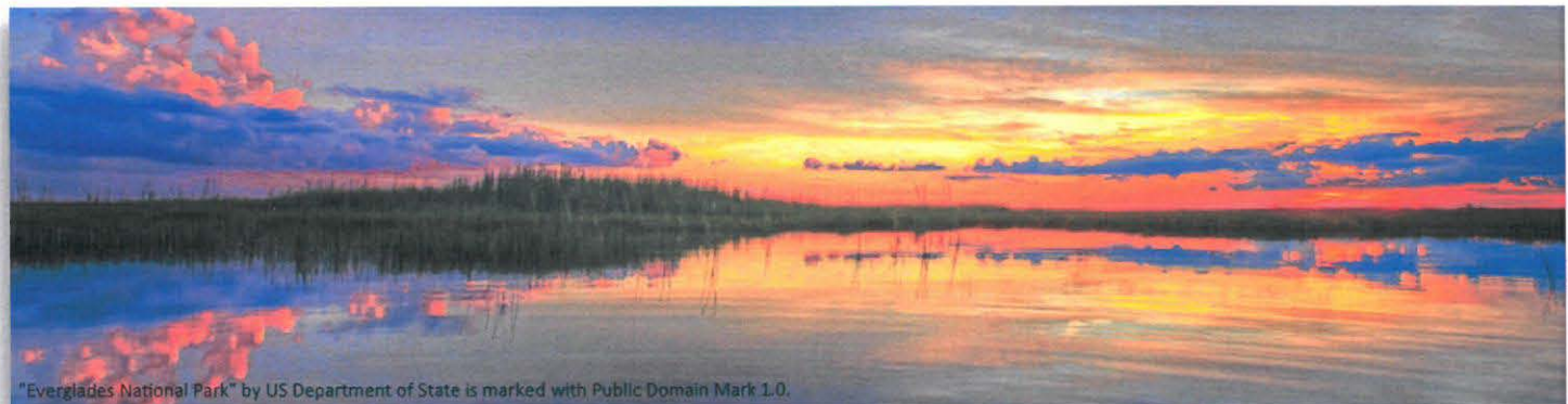
"Everglades National Park"

This morning we’ll have breakfast at the hotel before departing for a guided tour of Palm Beach - one of the richest towns in the U.S. We’ll drive by Donald Trump’s Mar-a-Lago Estate as well as the mansions of Rod Stewart and Yoko Ono, just to name a few. Next, we are headed to the Ballpark of the Palm Beaches , the home of the Washington Nationals , where we’ll take our seats for an exciting Cardinals away game! Tonight we will have free time in West Palm Beach at City Place , an open-air plaza that brings old-world architecture, beautiful fountains, and sidewalk cafes together to create an atmosphere strikingly reminiscent of a European town center. With more than 20 restaurants from which to choose, you’ll find dining options for every taste and have time for some shopping as well.