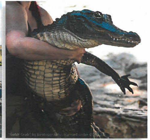
"Gator Grab" by binstopper, licensed under CC BY-SA 4.0